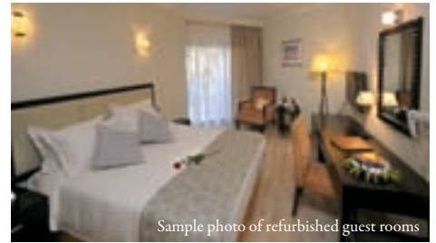
Sample photo of refurbished guest rooms