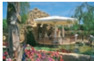
OLYMPIC LAGOON RESORT