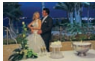
ALEXANDER THE GREAT

At Kanika Hotels, we thoroughly enjoy hosting this special day in your life, and express our best wishes with our own Kanika gifts. These include complimentary room upgrades wherever possible, local champagne, flowers, balloons, luxurious toiletries and various little gifts in the room, as well as the complimentary service of our wedding coordinator. For full details, please check our website at: www.kanikahotels.com