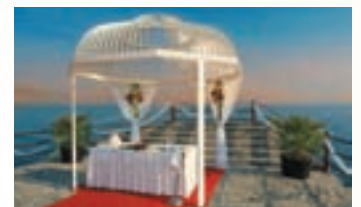
ELIAS BEACH HOTEL