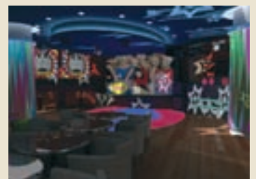
NEW TEENS CLUB